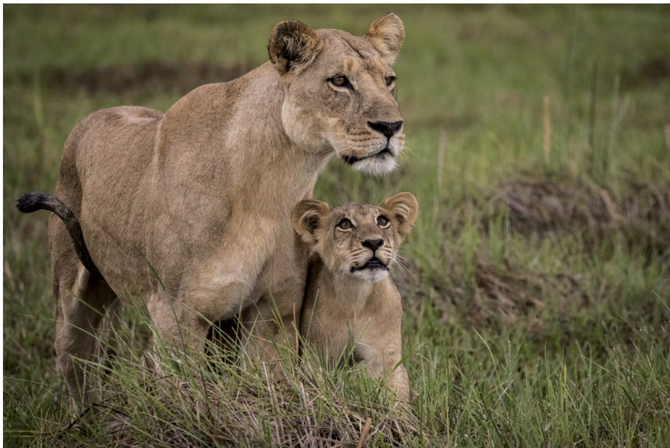
A lioness with her adoring cub, Mombo, Botswana

Explore this area with expert guides on game drives in the early morning and late afternoon.